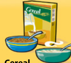
Cereal Cold: 30 g Hot: 175 mL (¾ cup)