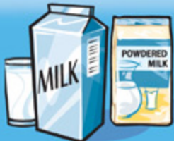
Milk or powdered milk (reconstituted) 250 mL (1 cup)