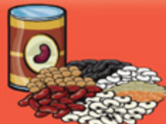
Cooked legumes 175 mL (¾ cup)