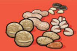
Shelled nuts and seeds 60 mL (¼ cup)