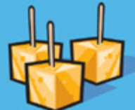
Cheese 50 g (1 ½ oz.)