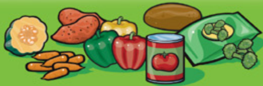
Fresh, frozen or canned vegetables 125 mL (½ cup)