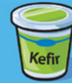
Kefir 175 g (¾ cup)