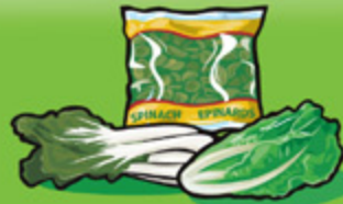
Leafy vegetables Cooked: 125 mL (½ cup) Raw: 250 mL (1 cup)