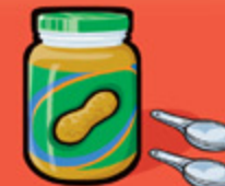
Peanut or nut butters 30 mL (2 Tbsp)