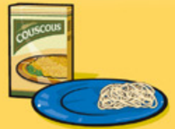
Cooked pasta or couscous 125 mL (½ cup)