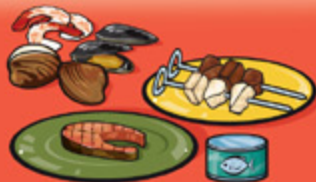
Cooked fish, shellfish, poultry, lean meat 75 g (2 ½ oz.)/125 mL (½ cup)