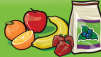
Fresh, frozen or canned fruits 1 fruit or 125 mL (½ cup)