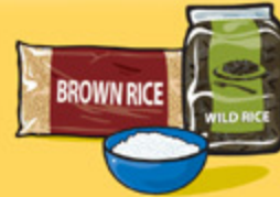
Cooked rice, bulgur or quinoa 125 mL (½ cup)