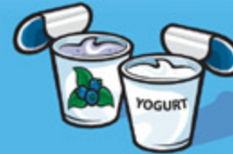
Yogurt 175 g (¾ cup)